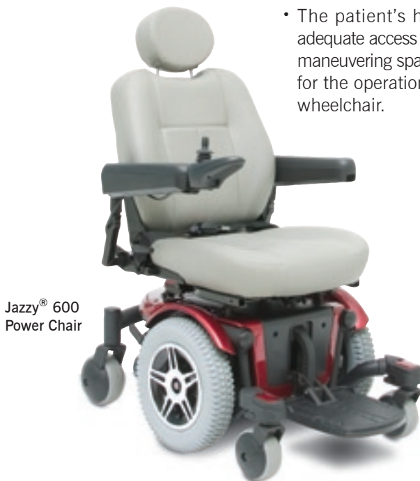
Jazzy ® 600 Power Chair