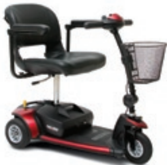
Pride ® Go-Go Elite Traveller ®

Some scooters have a turning radius as small as 32"