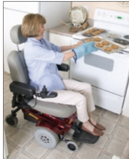
Jazzy ® Select ™ Power Chair shown in the home