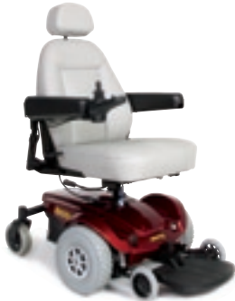
Jazzy Select ® Power Chair

Some mid-wheel drive power chairs have a turning radius as small as 18"